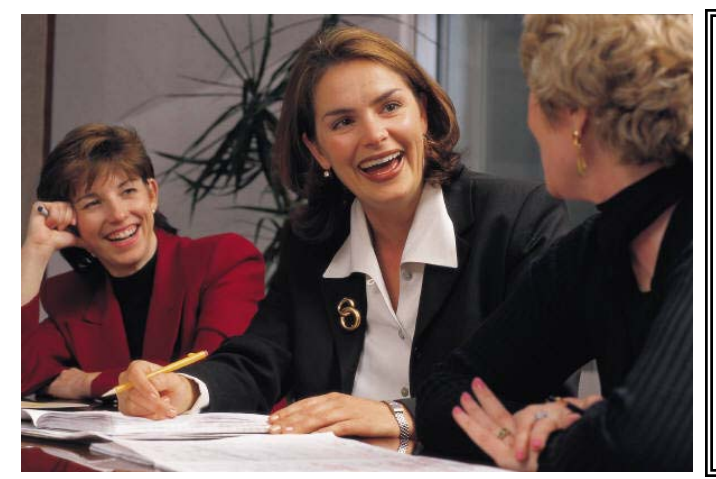
News & Views

AAUW will be a powerful advocate and visible leader in equity and education through research, philanthropy, and measurable change in critical areas impacting on the lives of women and girls.